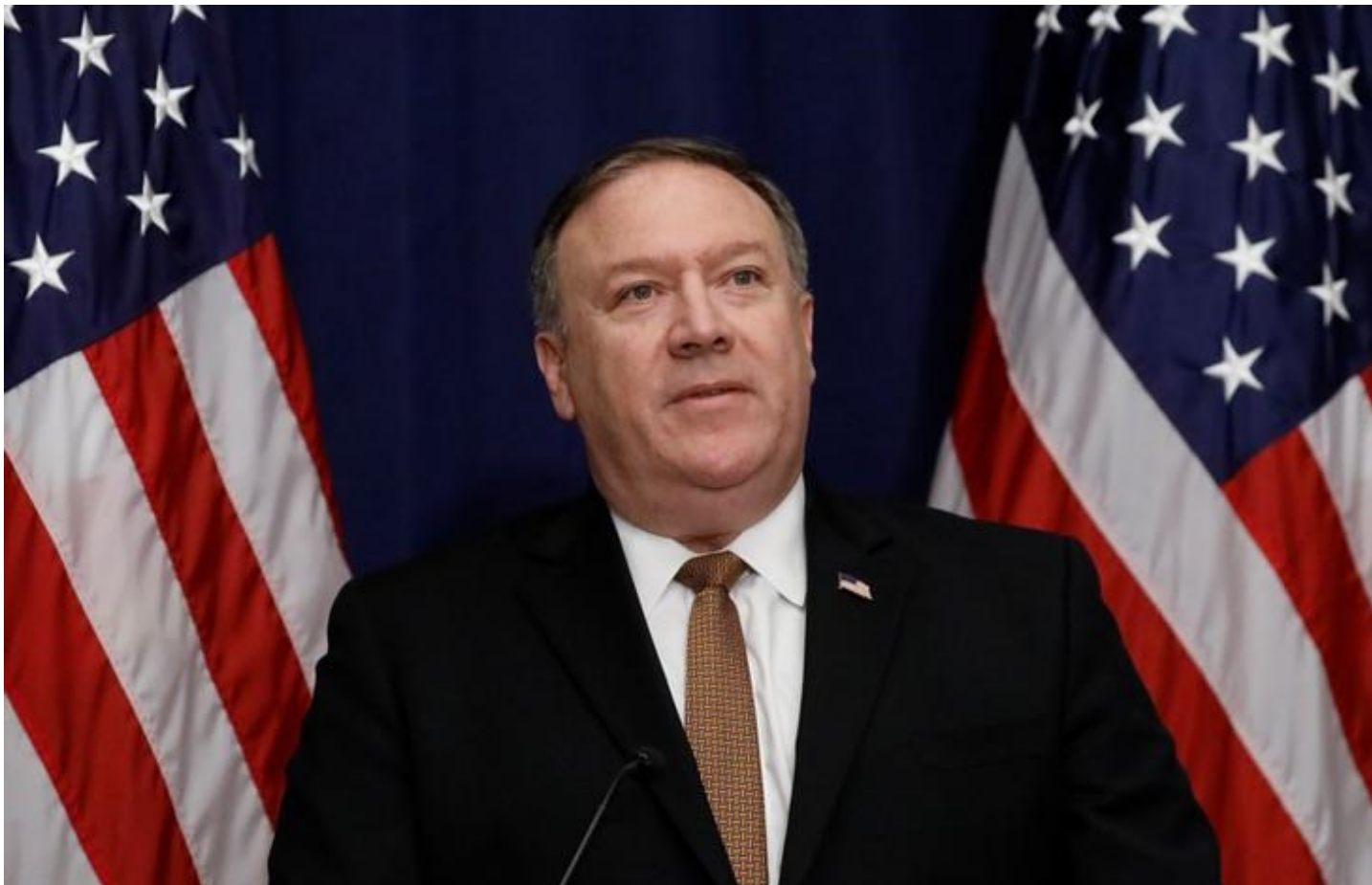
U.S. Secretary of State Mike Pompeo speaks during a news conference following a meeting with North Korea's envoy Kim Yong Chol in New York, U.S., May 31, 2018.