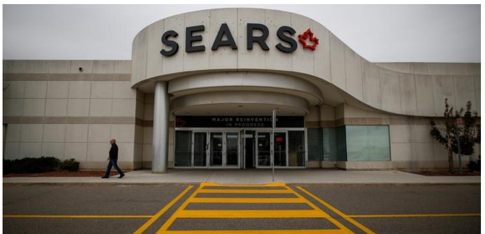
A man walks in front of a Sears store in Mississauga, Ontario, Canada, October 6, 2017.

All eight of Facebook's director nominees were elected at its annual meeting and all six shareholder proposals urging reforms, including to its voting structure and content oversight, were rejected, company executives said. They did not immediately give vote tallies at the annual meeting in Menlo Park, California, which was webcast. That left unclear to what extent outside investors cast ballots in favor of the company and Chief Executive Mark Zuckerberg, who with other insiders controls about 60 percent of votes at the world's largest social media network.